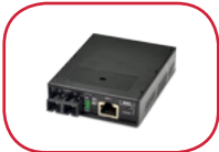
Non Wall-Mount Type