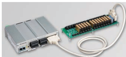
Interface to isolated 8B analog output modules.

With Acromag's i2o technology, you can map inputs from ES215x units to output channels on an ES2172 module. Select updates based on time or on a percent of range change (100mS or 0.1% resolution).