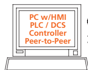
Dual Ethernet Ports