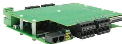
Open circuit board versions are also available.

CE, UL/cUL: Zone 2, Class 1, Division 2, Groups ABCD