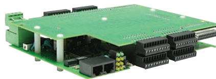
Open circuit board versions are also available.

CE, UL/cUL: Zone 2, Class 1, Division 2, Groups ABCD